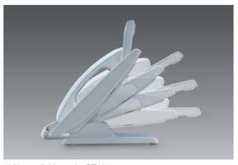
*2 Not available on the DT321

The double-tilt design lets you adjust the base unit and LCD angles to match desks, tables, or any location. The base unit can be adjusted in eight steps, and the LCD moves separately to optimise the viewing angle.