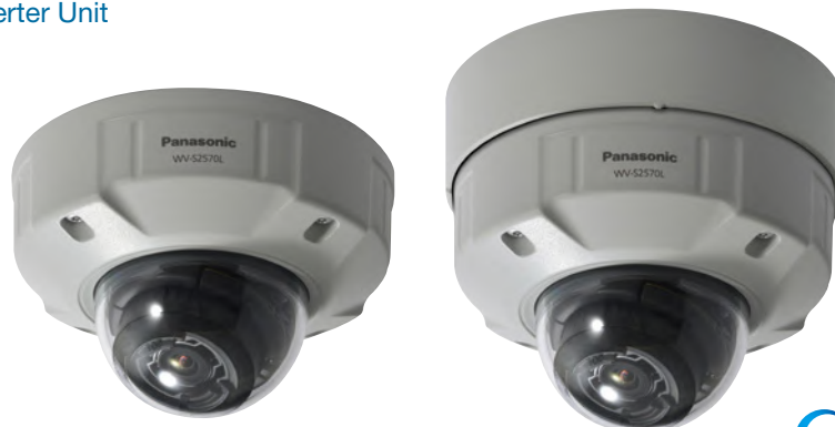
with Base Bracket