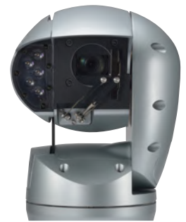
IR LED Unit : Optional WV-SUD6FRL1 (Natural Silver) WV-SUD6FRL-H (Gray) WV-SUD6FRL-T (Brown)