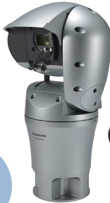
WV-SUD638 (Natural Silver) WV-SUD638-H (Gray) WV-SUD638-T (Brown)